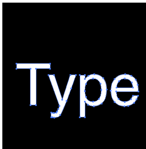
Text converted to outlines